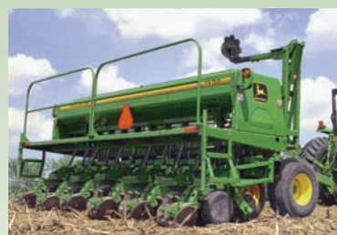
Planters and Drills