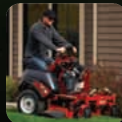
Easy handling and maneuvering.