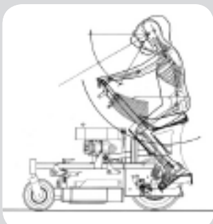
Operator is placed in the ideal ergonomic position to mow.