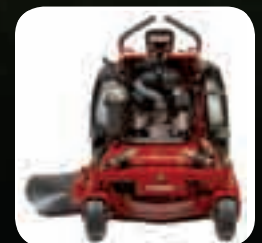
Fit into tight places with the compact size of the Evolution™ mower.