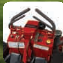
The operator has full view and reach of the easy-to-use controls. Push both handles to move forward, left and right to turn, and pull both handles back for reverse.