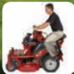
The patent pending operator forward design places the operator in the most ideal ergonomic position for a long day of mowing.