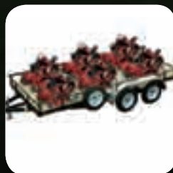
Fit more units on your trailer. (16ft. trailer shown)