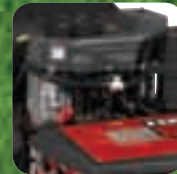
The convenience of electric start is a standard feature.