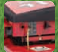
Quick-adjust height-of-cut indicator ensures consistent results.