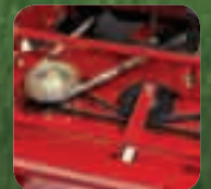
Exclusive Torque Tuned Blade™ system enables the mower to be more compact which allows the machine to be more maneuverable and easy to handle. (36" model)