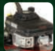
The Power to Perform - The powerful Kawasaki FJ180V overhead valve engine provides plenty of power for efficient mulching and features pressurized lubrication and a spin-on oil filter.