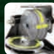
Disc drive delivers more of the engine's power directly to the drive wheels. It's the ultimate in reliable performance and because it eliminates complicated clutches, it offers easy serviceability. The automotive style smooth-turn differential makes turning smooth and easy.