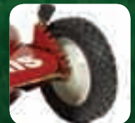
Features rugged 8-inch front steel wheels with ball bearings and 10-inch rear steel wheels.